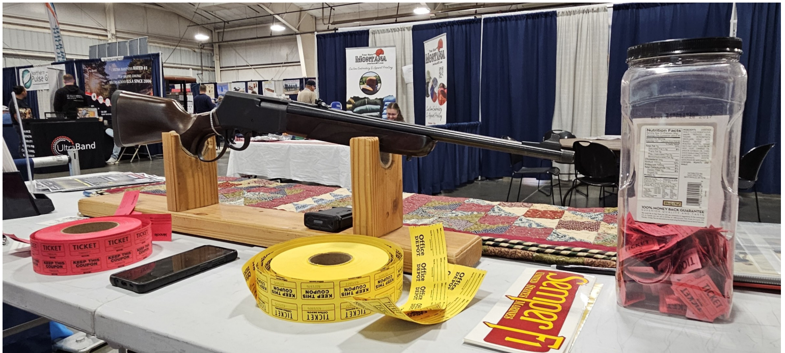
A behind the scenes look at the table at the MATE show. Both MATE and the Gun show had marines stop by, now if they would come to a meeting and sign up.