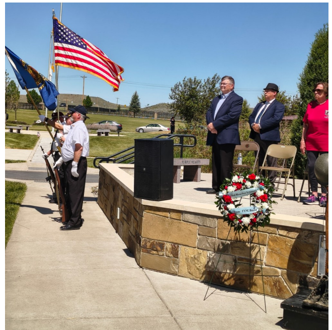
The Legion Color Guard and officials at Laurel National Cemetery on Memorial day.