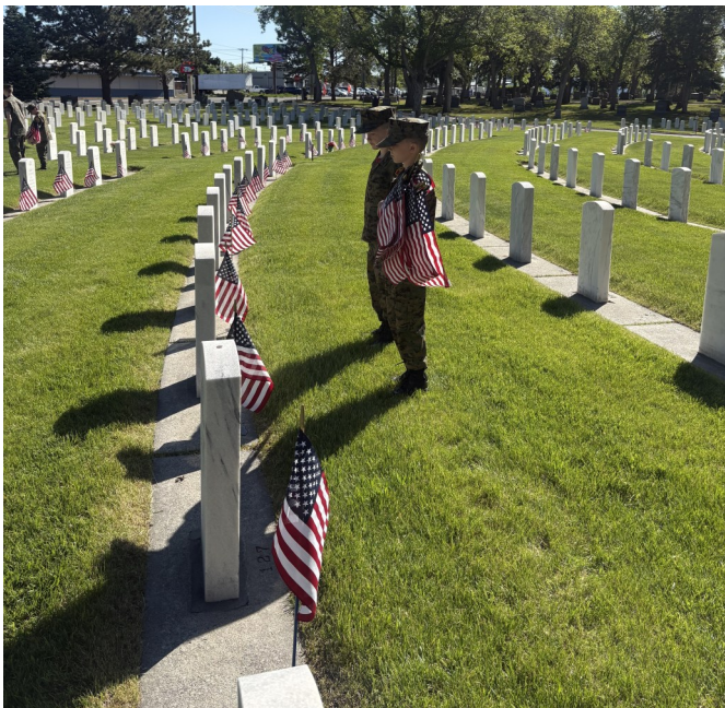
The Young Marines on flag detail for Memorial day 2026 at Mountview.

The next meeting will be held on June 11th, 2026